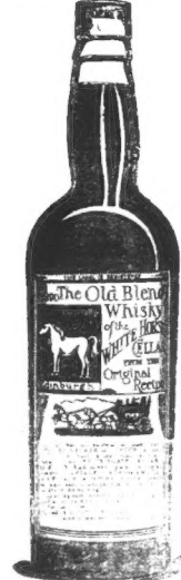
N. SPATHIS. CAIRO AND ALEXANDRIA.

N.B.—This Whisky is the same as supplied to the Red Cross Society, London, for use by the invalided troops and hospitals in South Africa, to the House Lords and House of Commons.